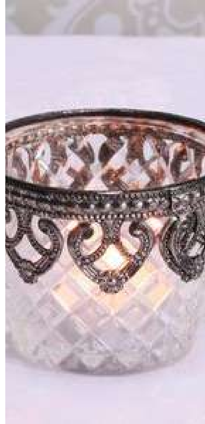
Baroque tea light holder