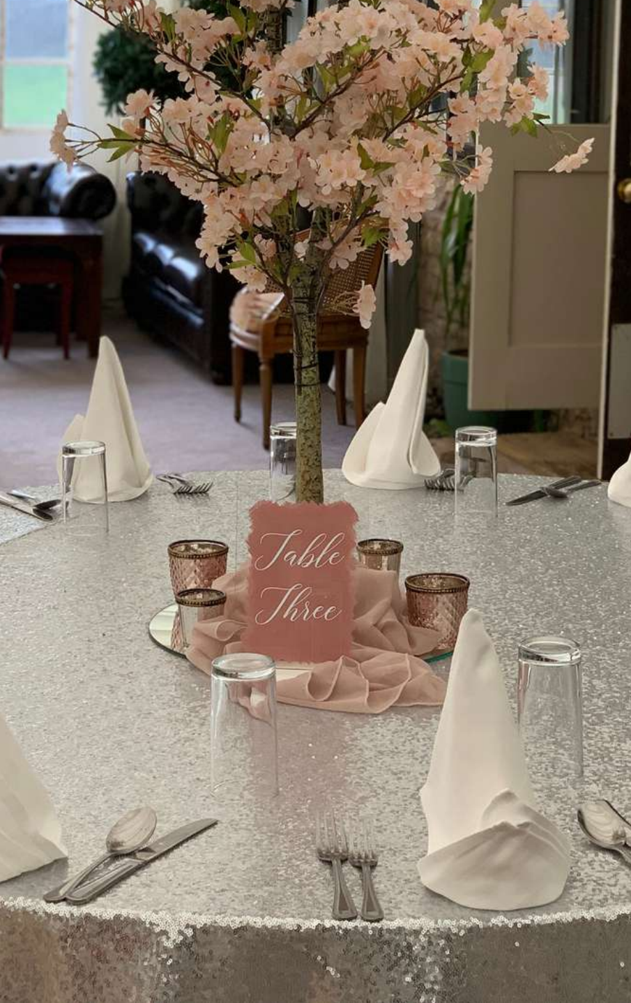
Sequin table cloths