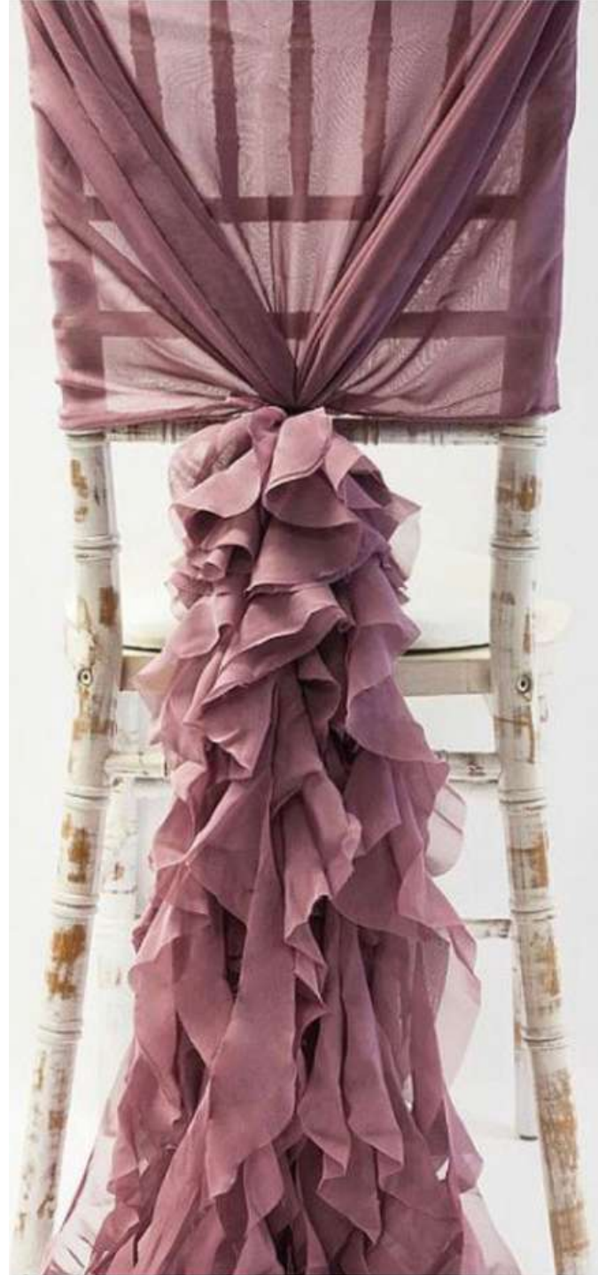
Ruffle chair hood