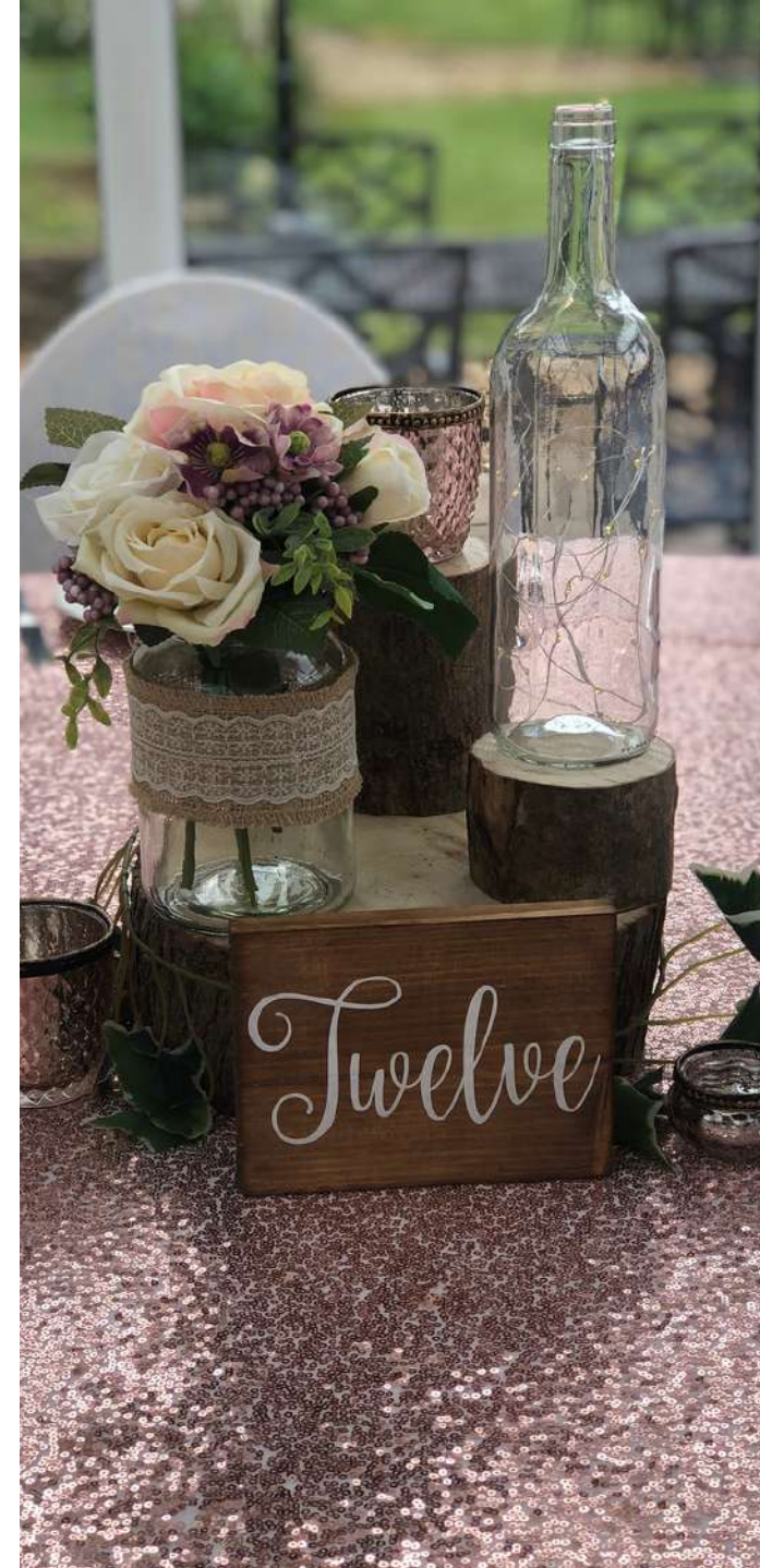
Log with bottle, candle, flowers and tea lights