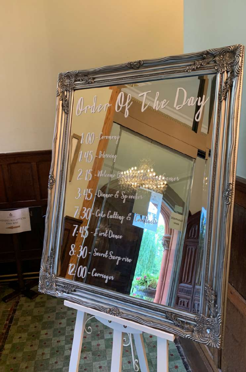
Order of the day