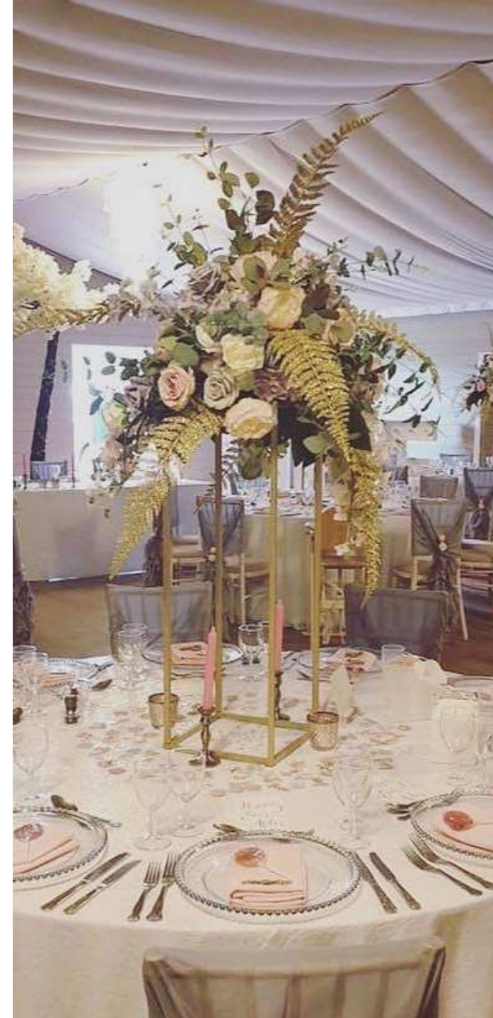
Metal Frame with arrangement