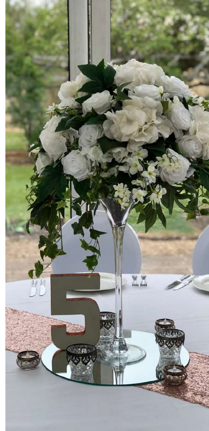
Martini Glass- White & Green arrangement