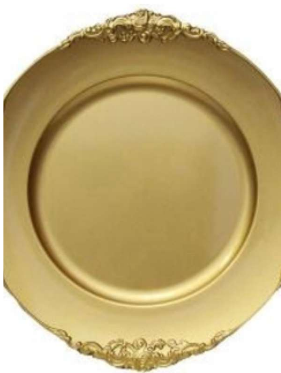
Ornate gold- plastic