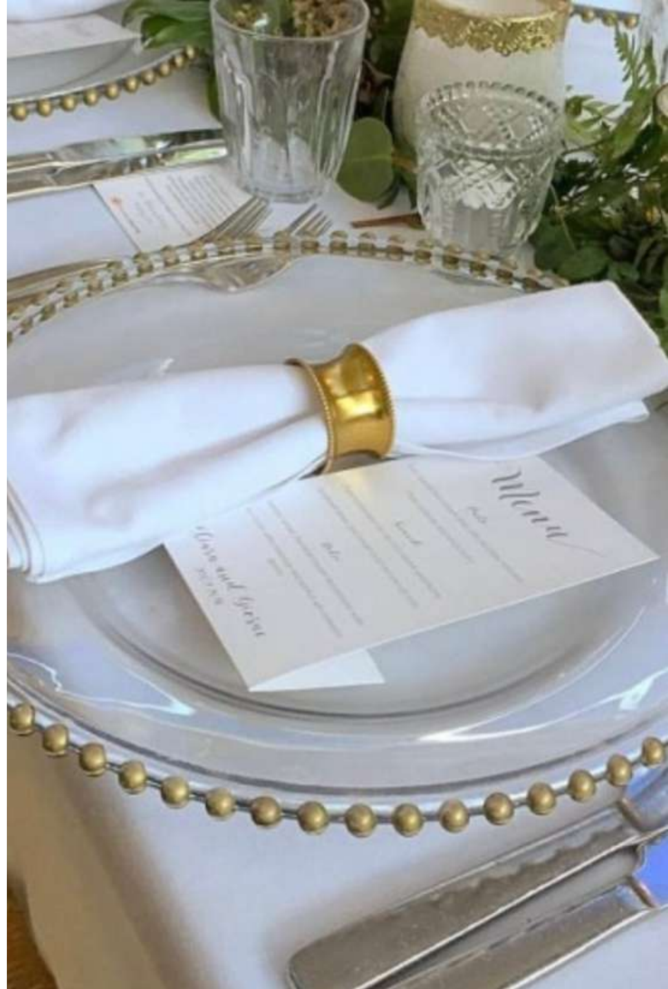
Gold beaded- glass