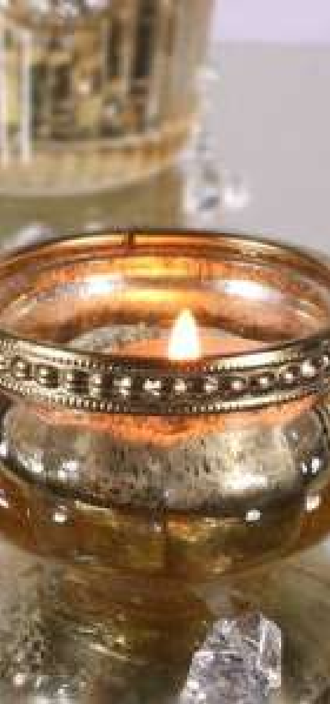
Bubble tea light holder