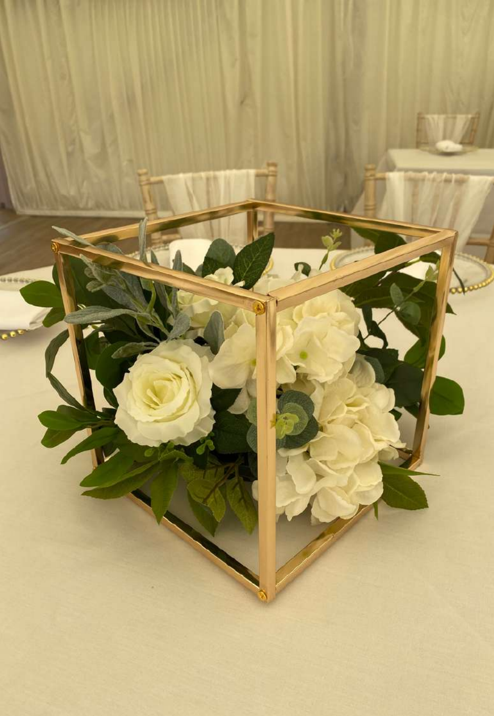
Small Metal Frame With Floral Arrangement