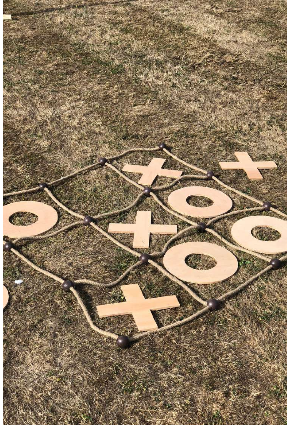
Naughts & crosses