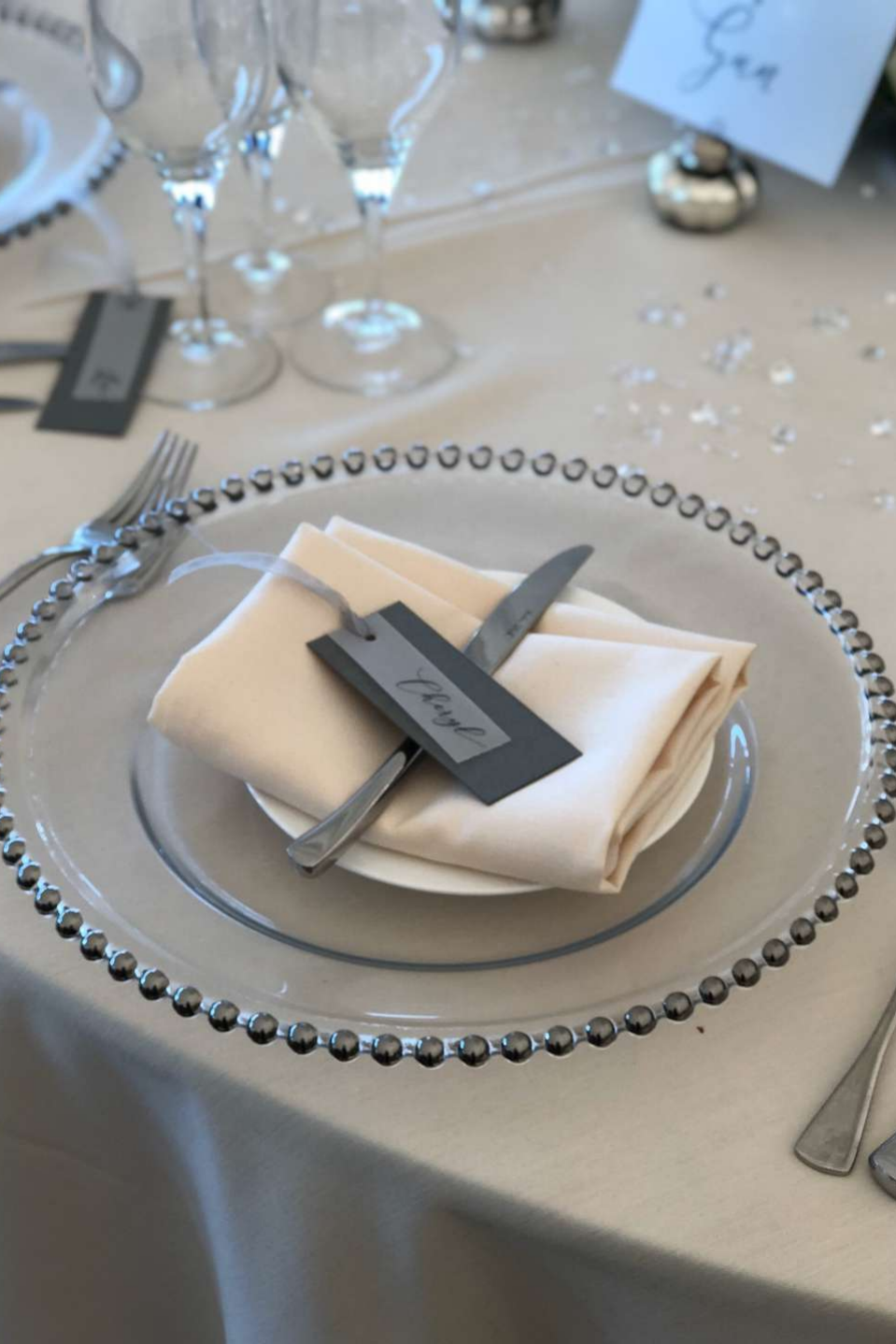
Silver beaded- glass