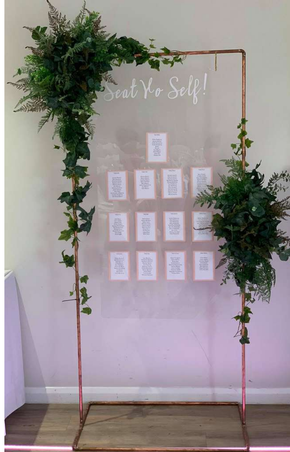
Copper seating plan