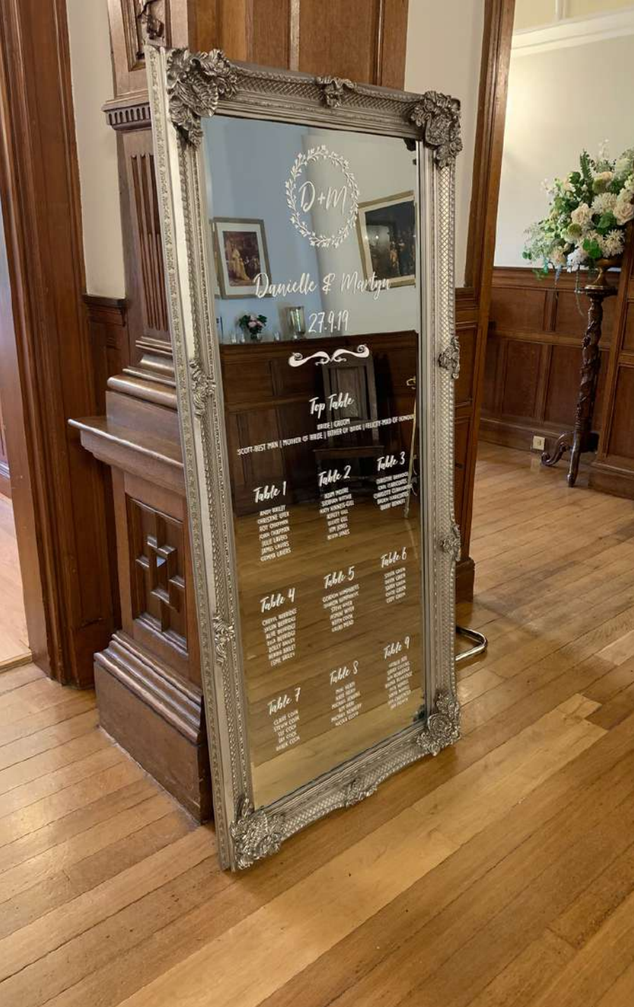
Floor standing table plan