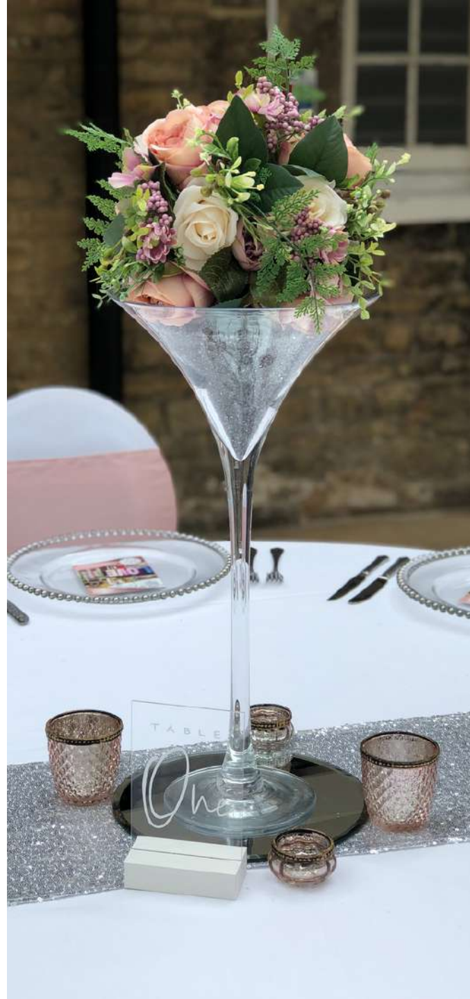
Martini Glass - Vintage arrangement