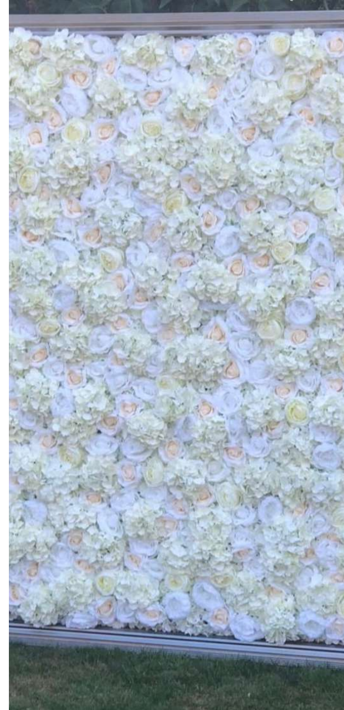
Framed flower wall