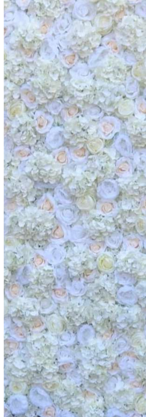
Flower wall styles