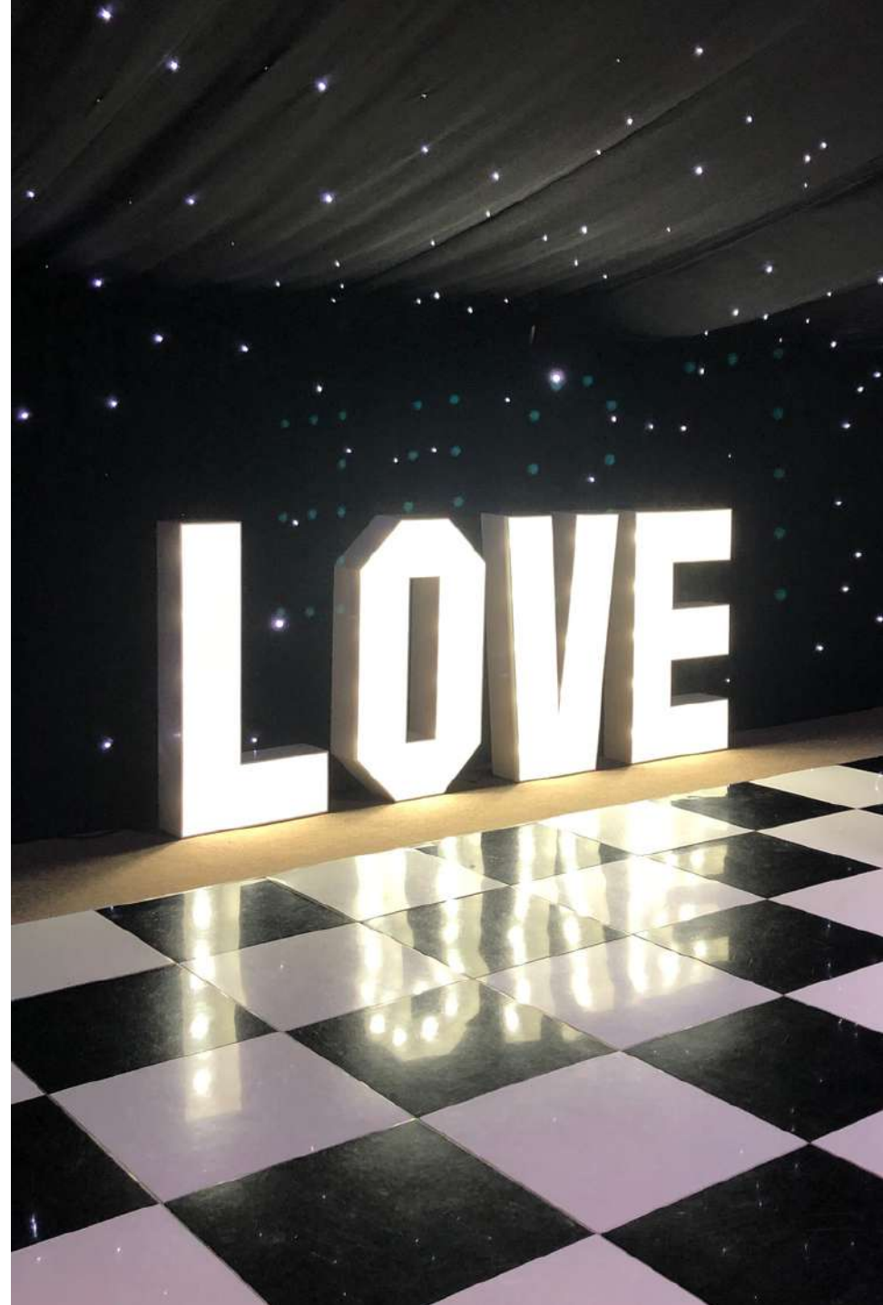
Classic LOVE (colour changing)