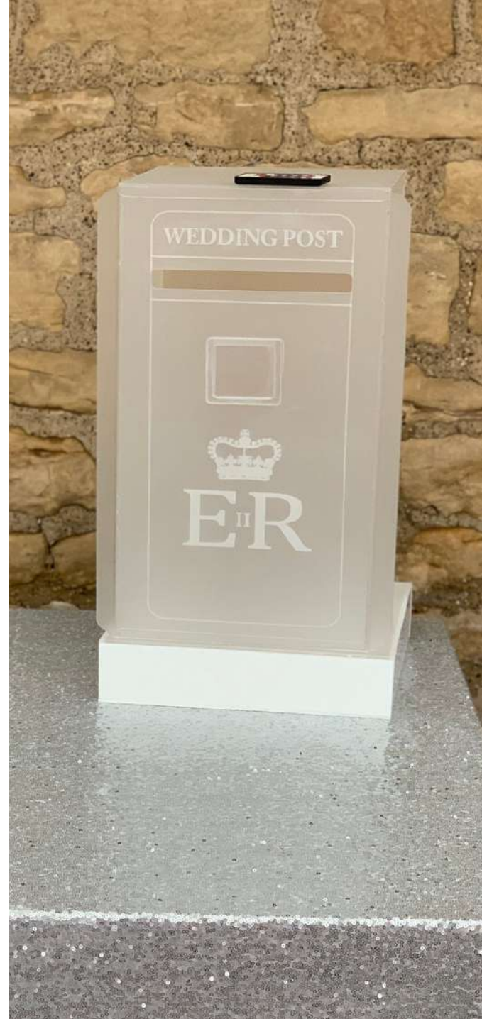
Light up frosted acrylic