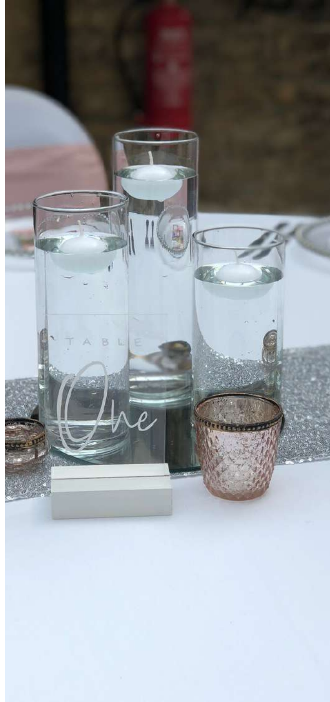
Cylinder Trio with floating candles