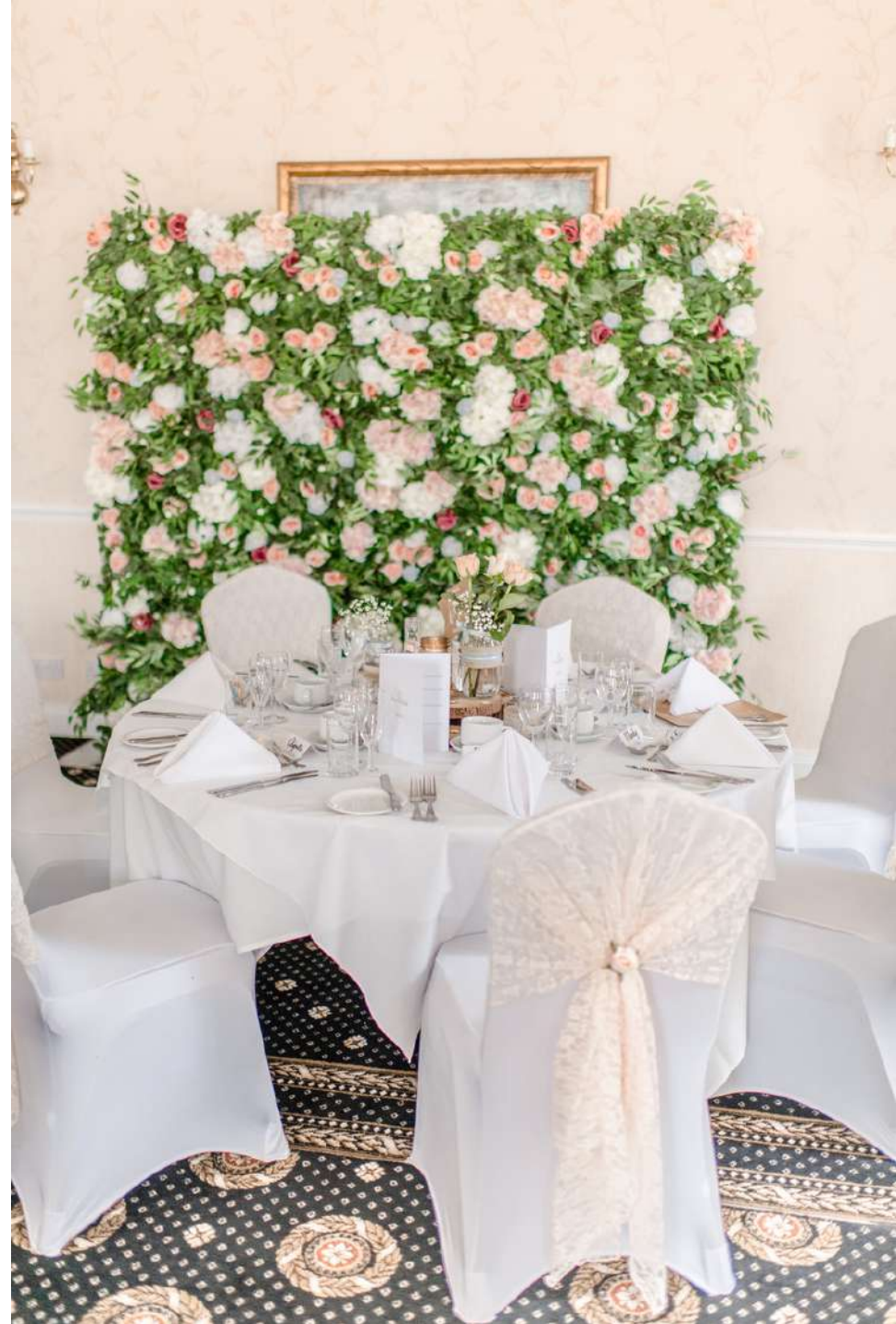
Unframed flower wall