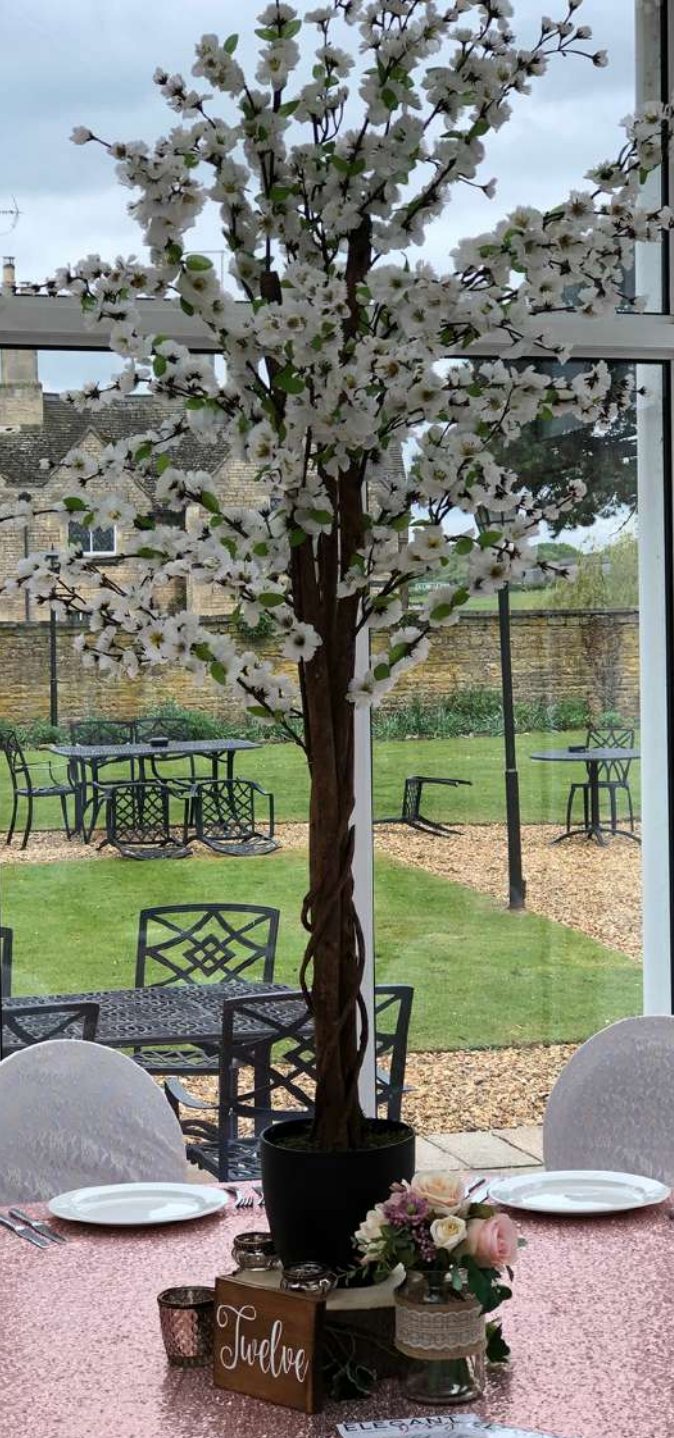
White Blossom Tree