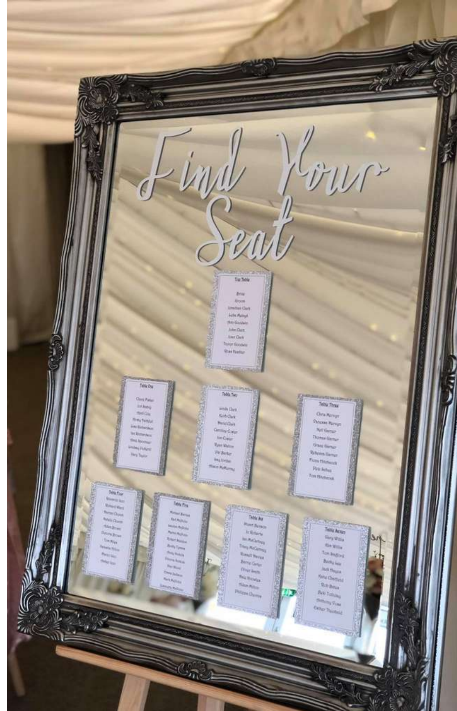
Mirror table plan