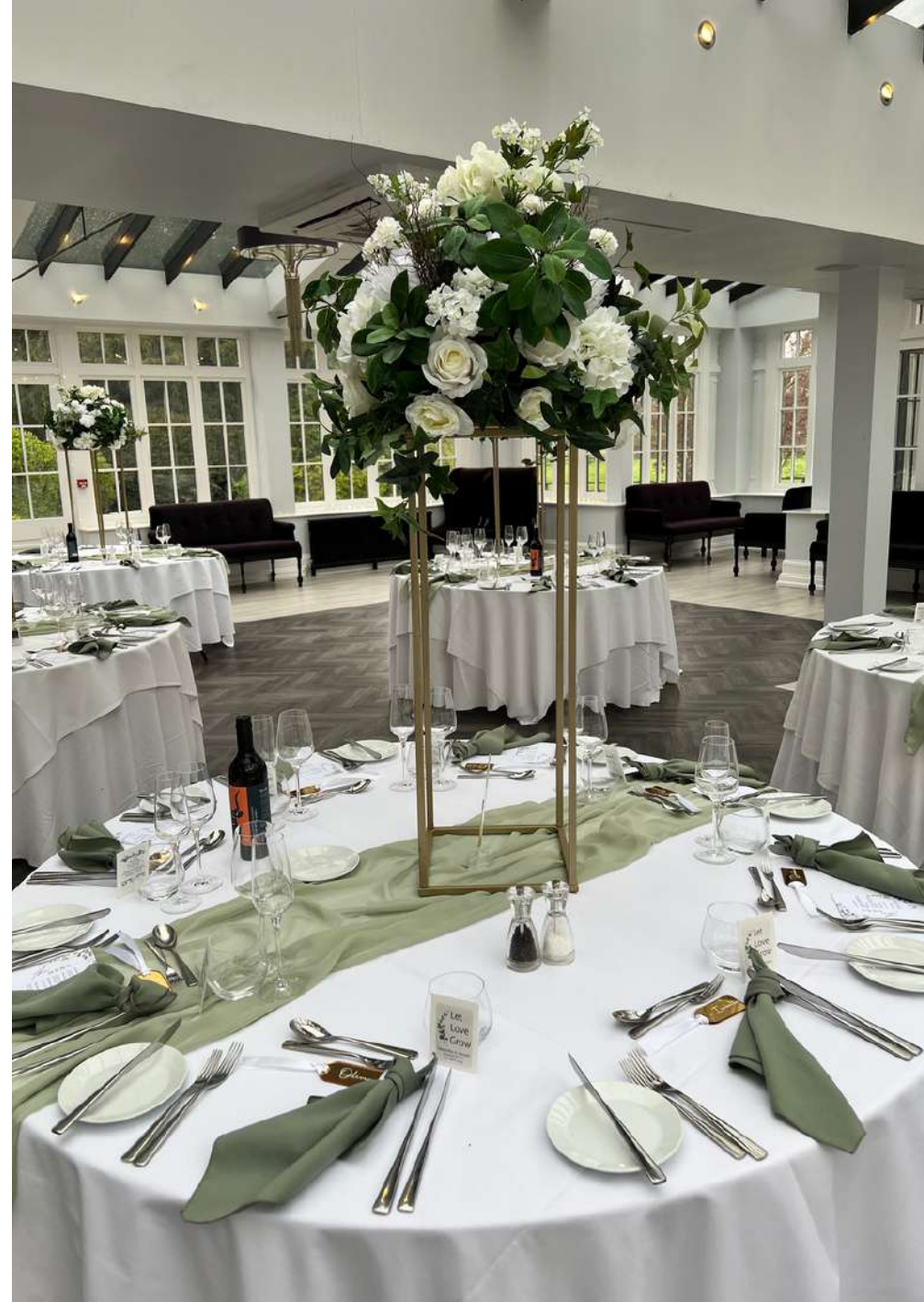
Tall Metal Frame With Floral Arrangement