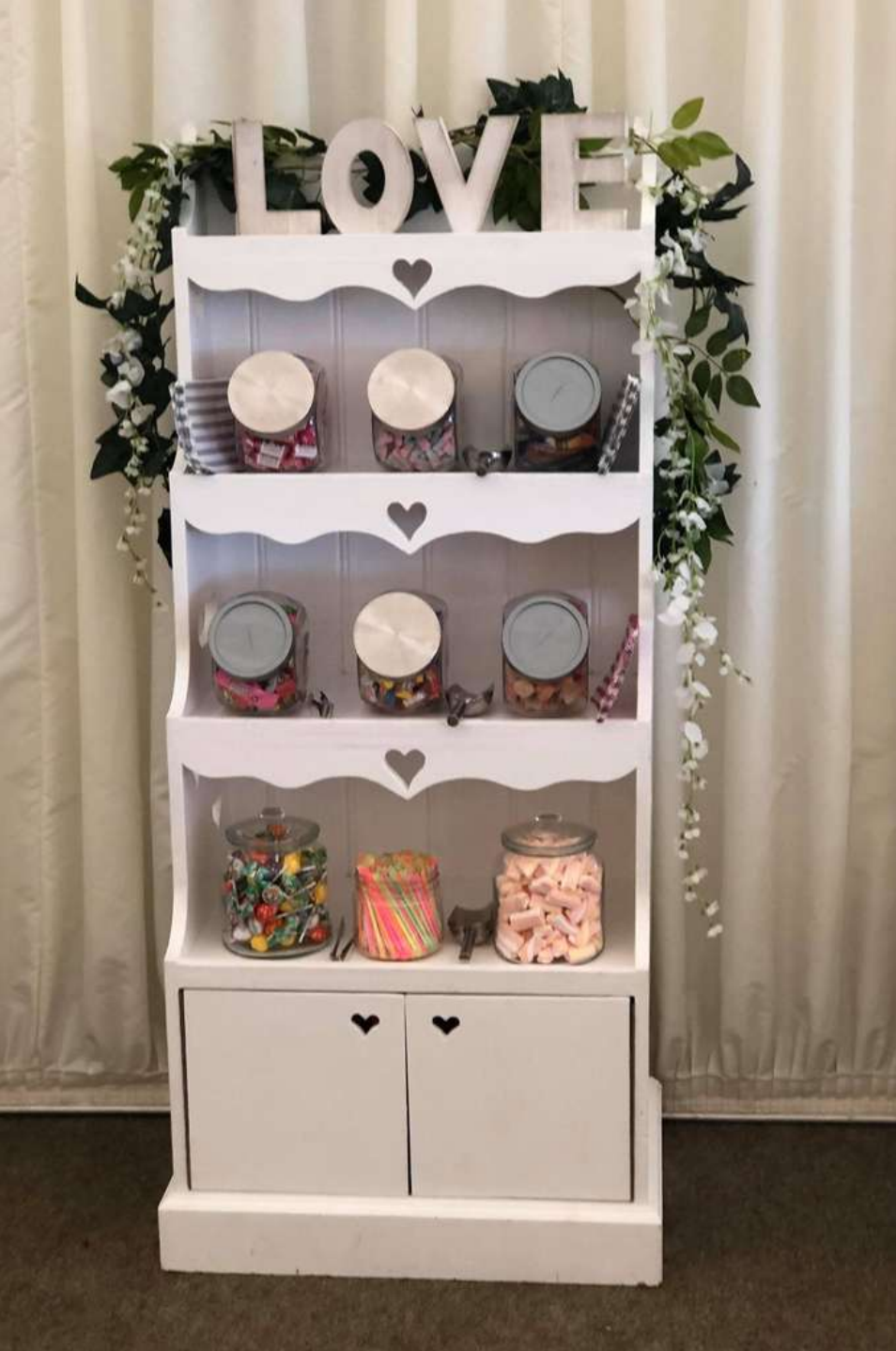
Elegant sweet stall