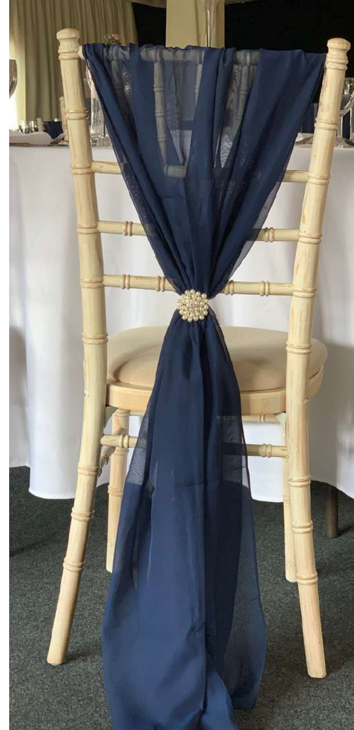
Drop sash with embellishment