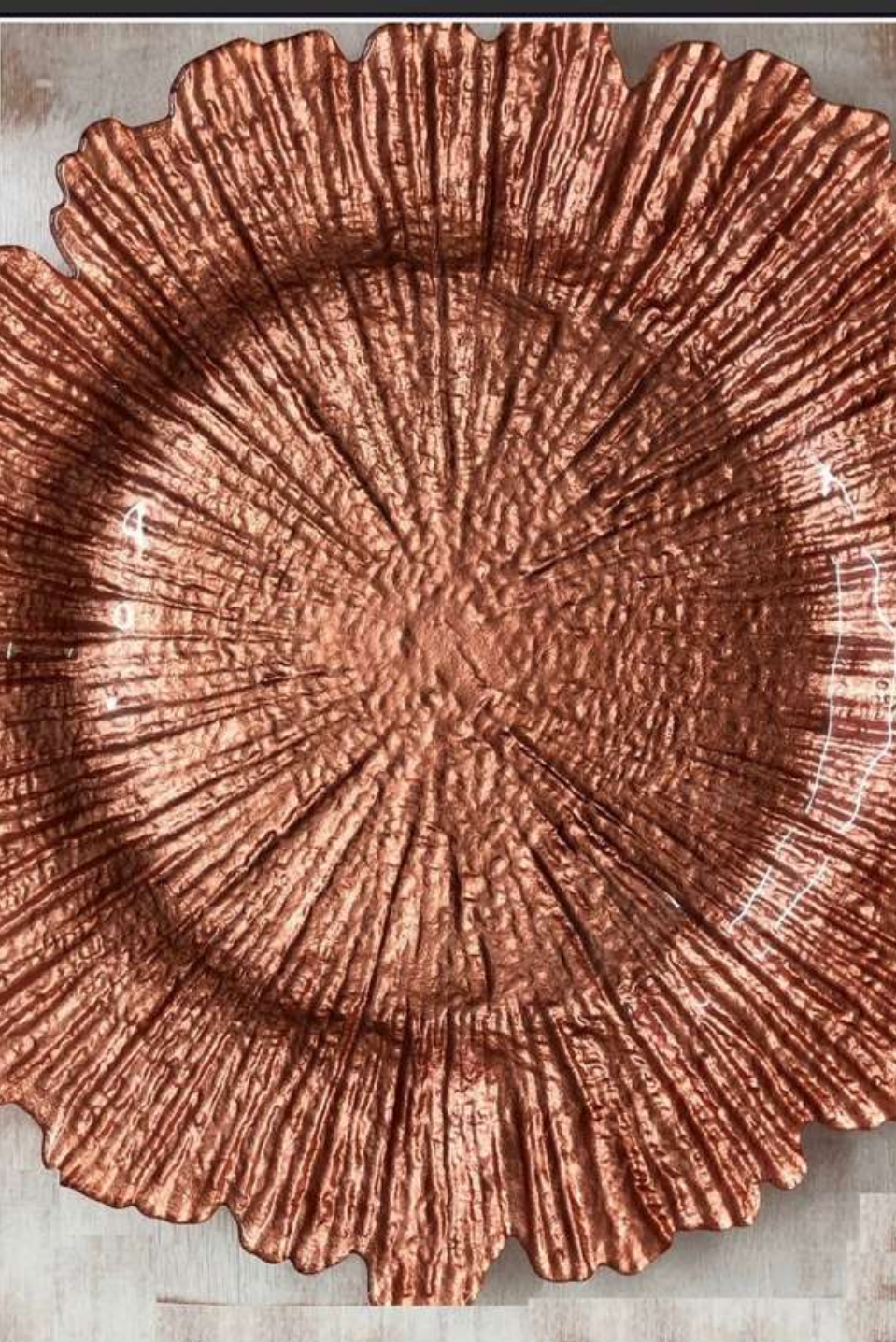
Copper burst- glass