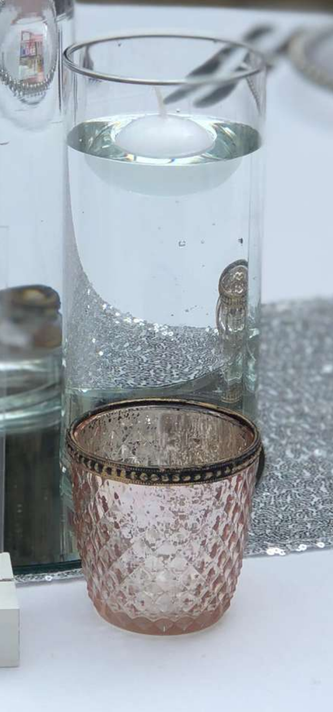
Geometric tea light holder