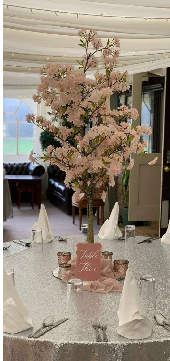
Pink Blossom Tree