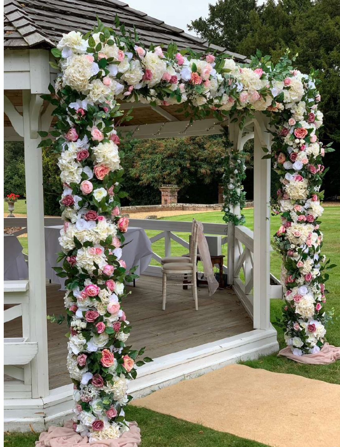
Square Floral arch