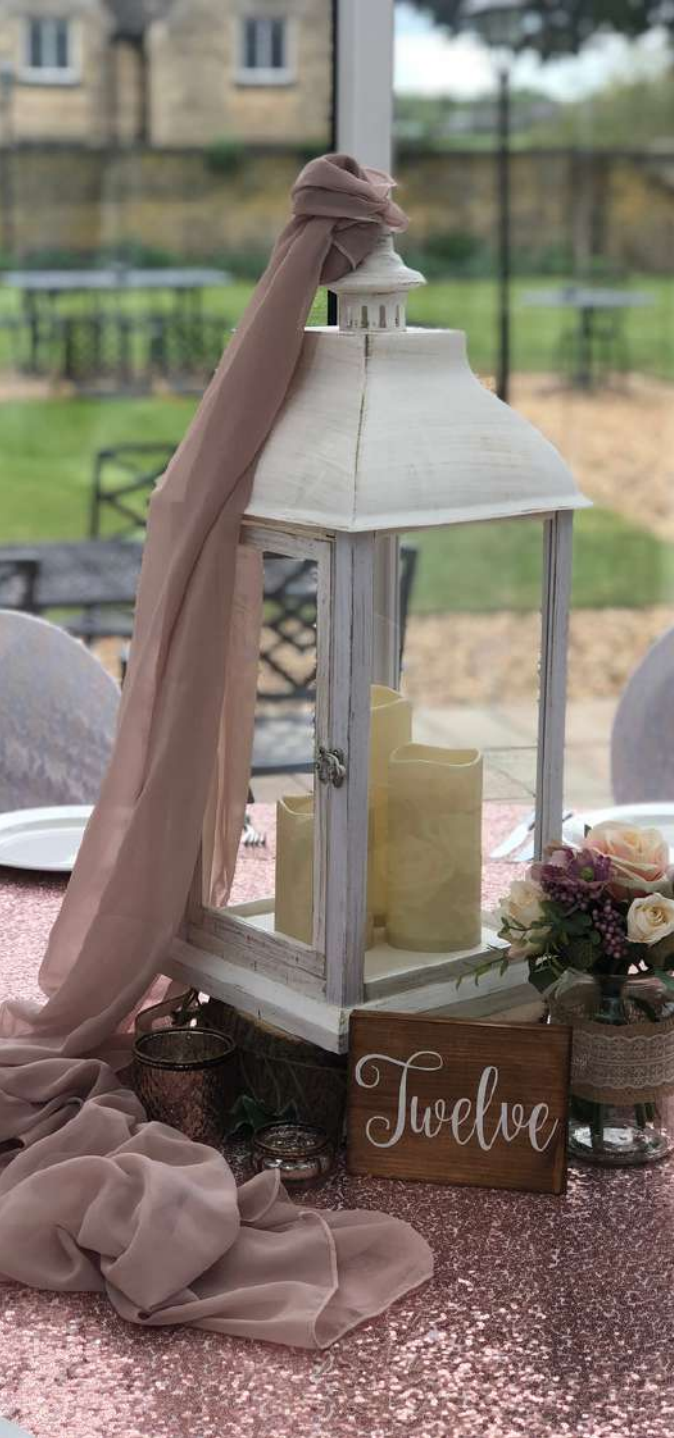
Lantern with logs, drape, flowers and candles