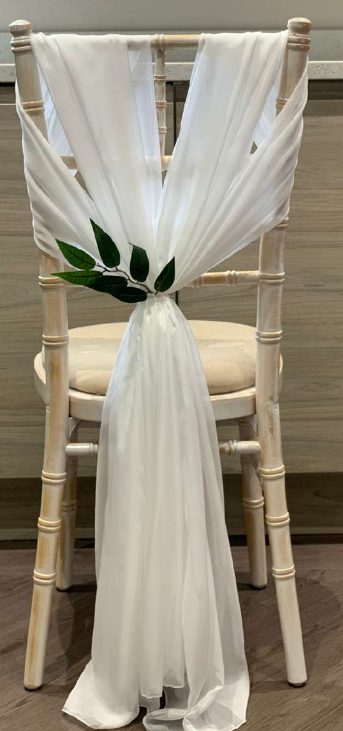
Chiffon two tie with embellishment