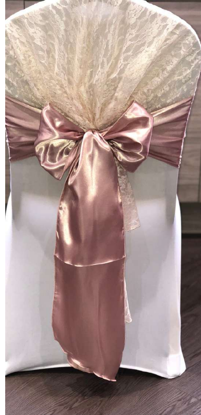
Chair cover with sash and hood