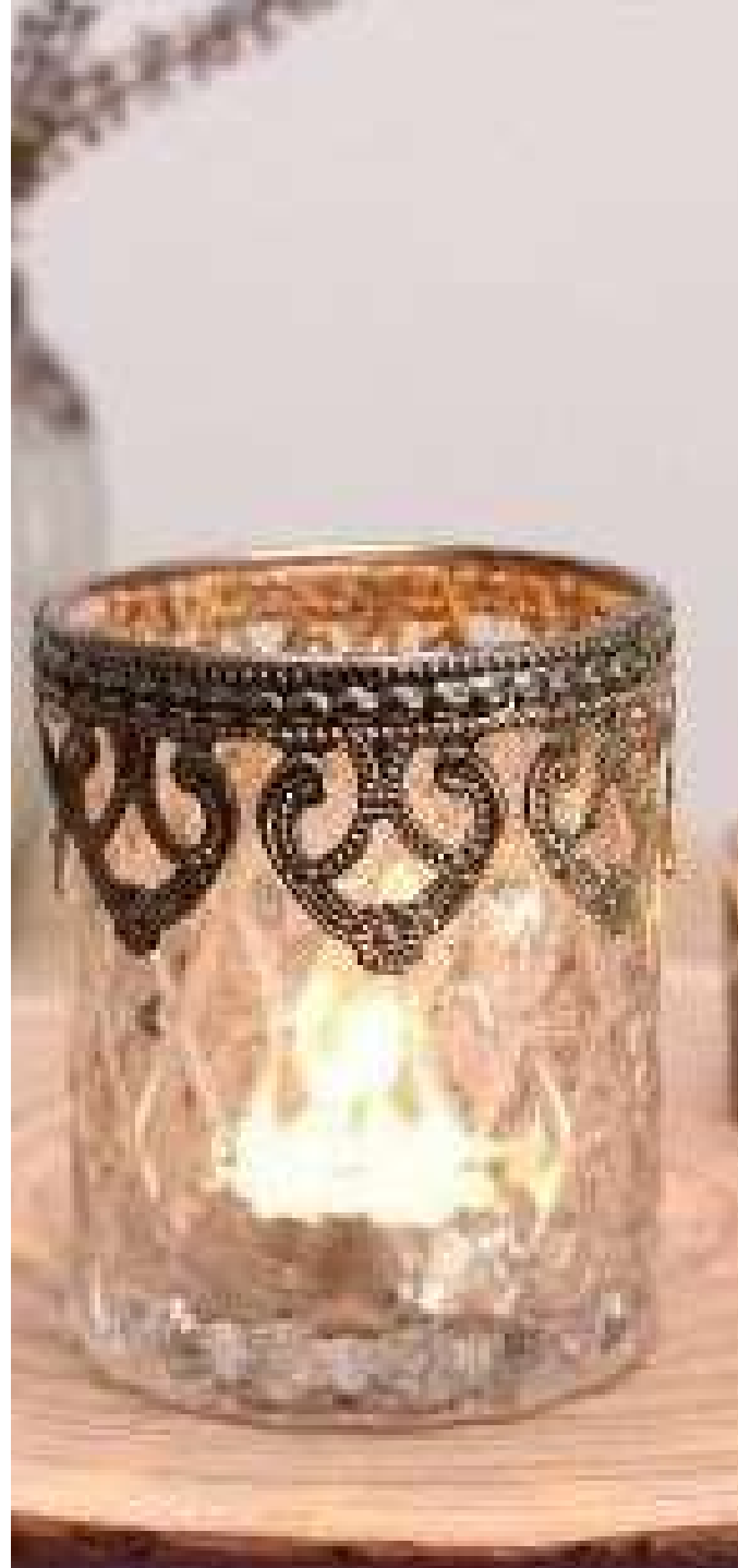
Baroque tea light holder