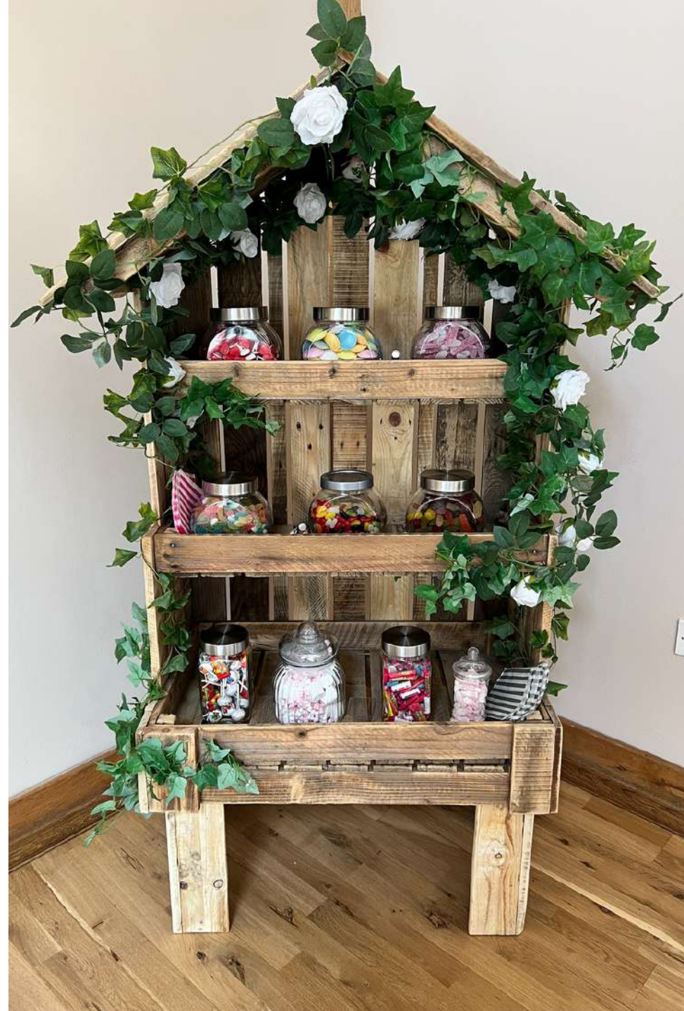
Rustic sweet stall