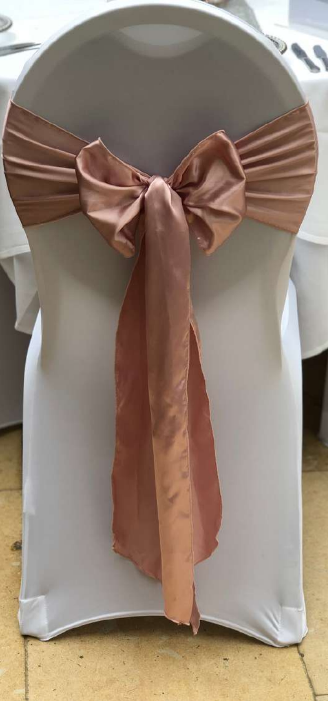
Chair cover and sash or hood