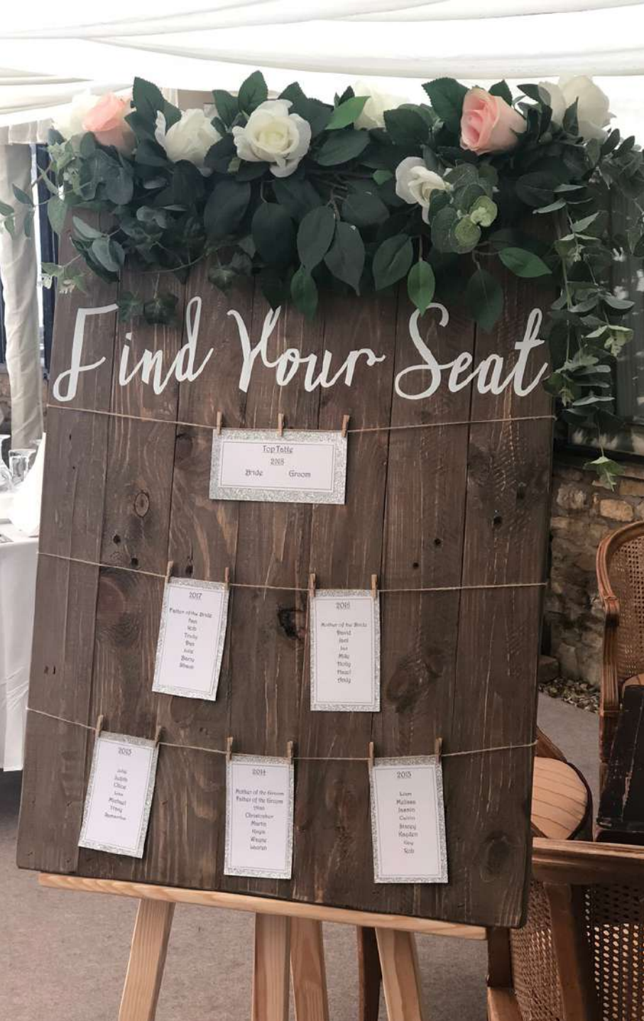
Wooden table plan