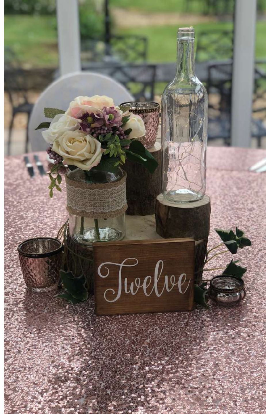
Sequin table cloths

Our sequin over lays are available in silver, rose gold, navy and white. If you need a different colour please let us know!