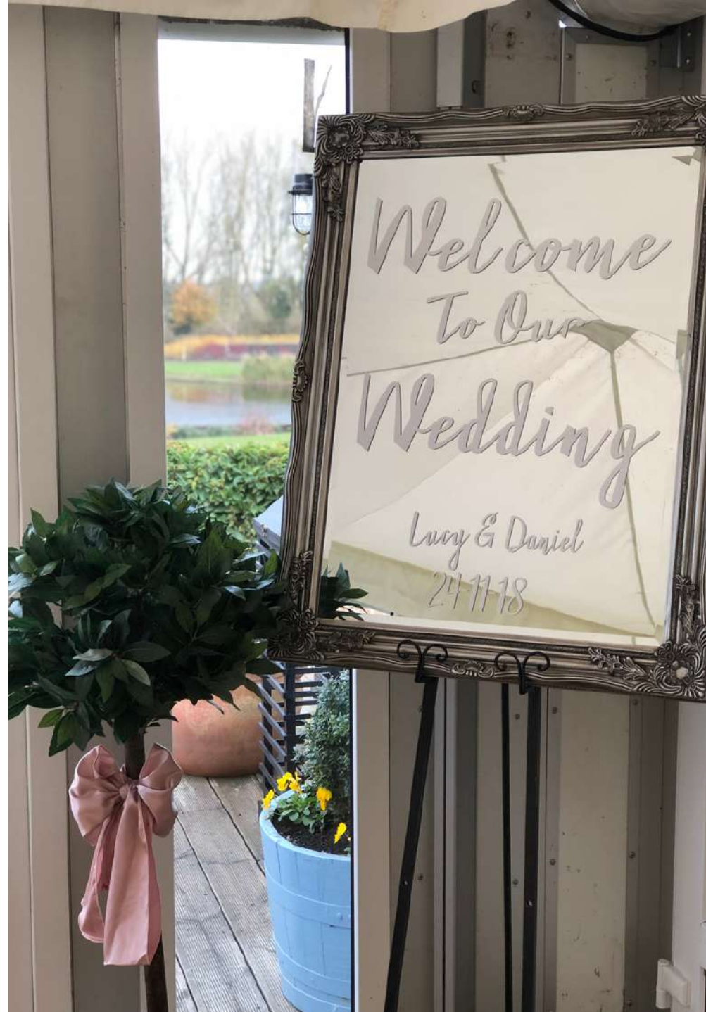
Mirror welcome sign