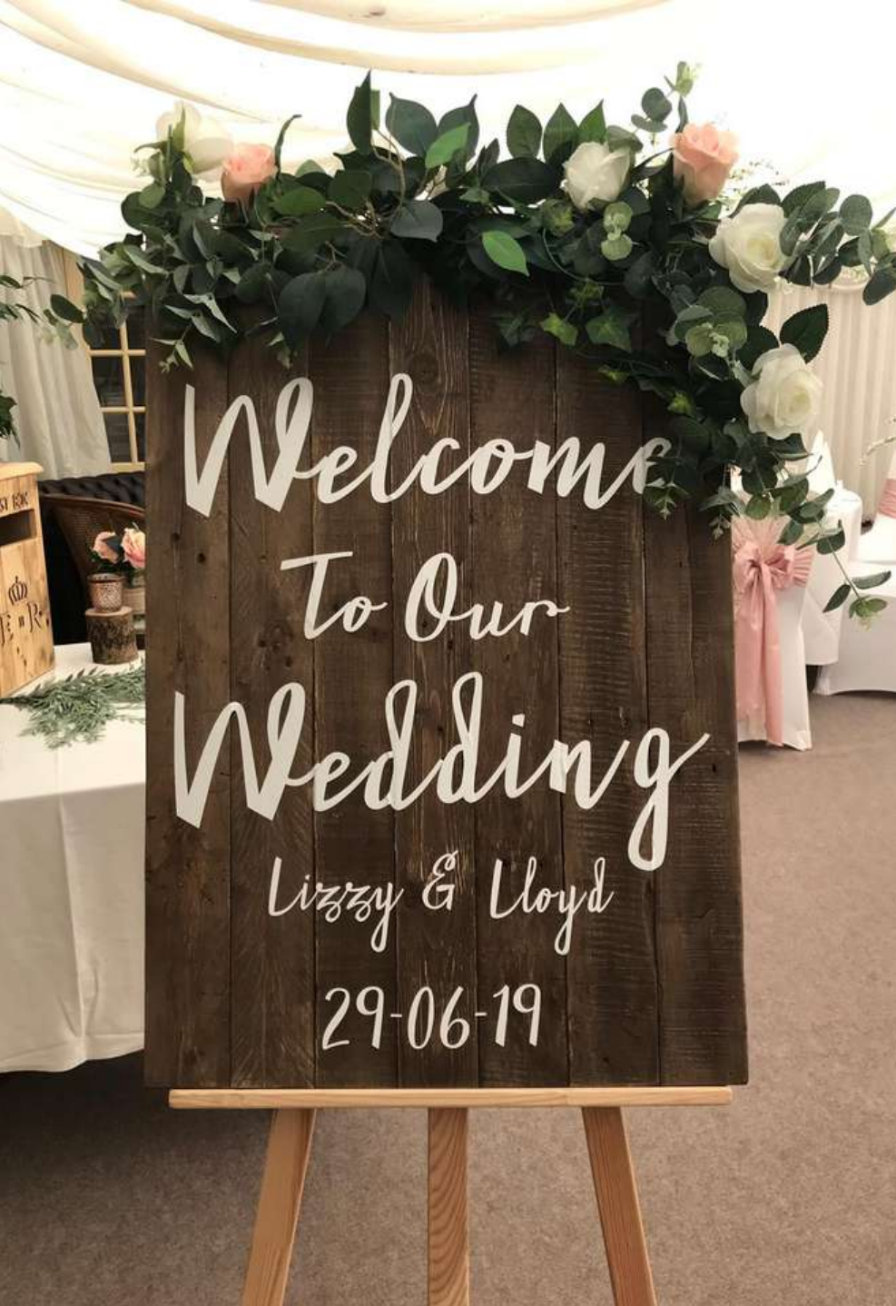
Wooden welcome sign