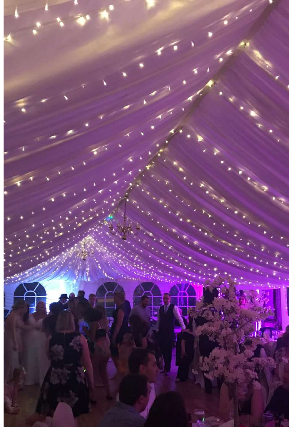
Fairy light canopy