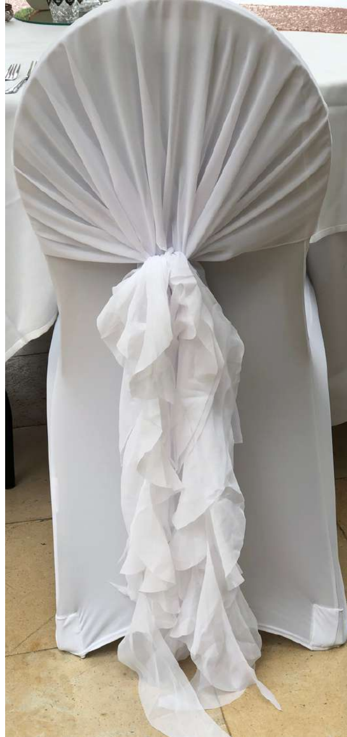
Chair Cover and ruffle hood