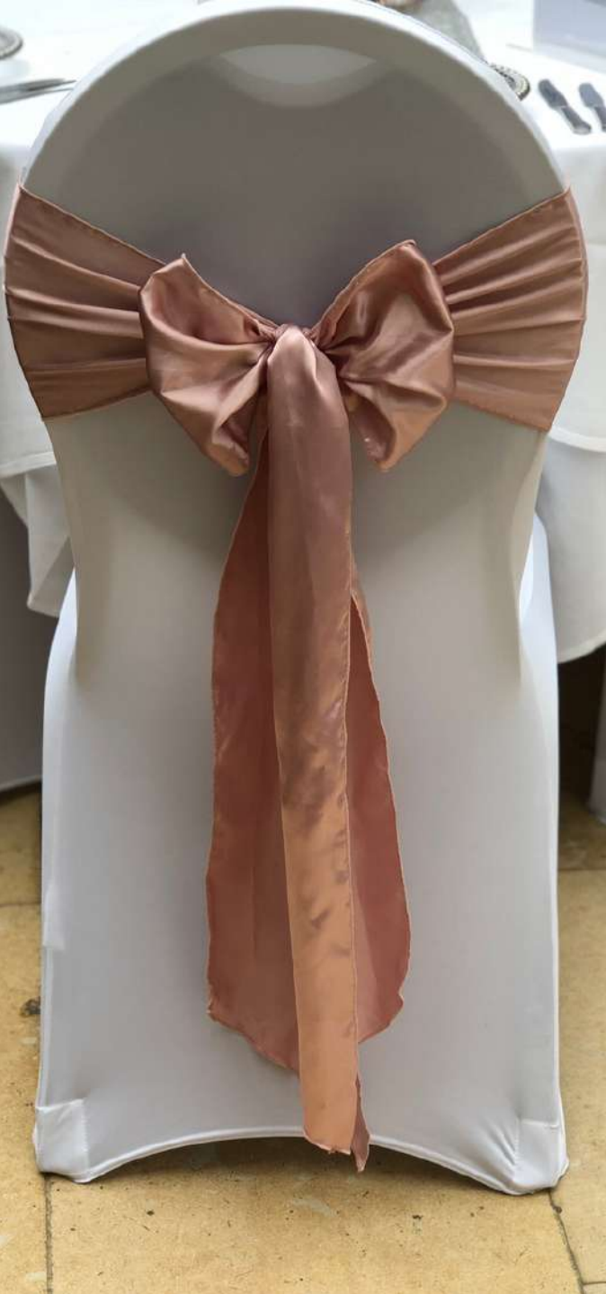
Chair cover and sash or hood