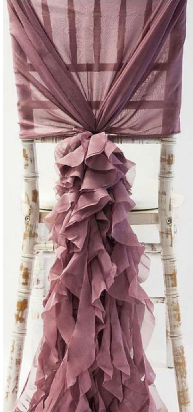
Ruffle chair hood