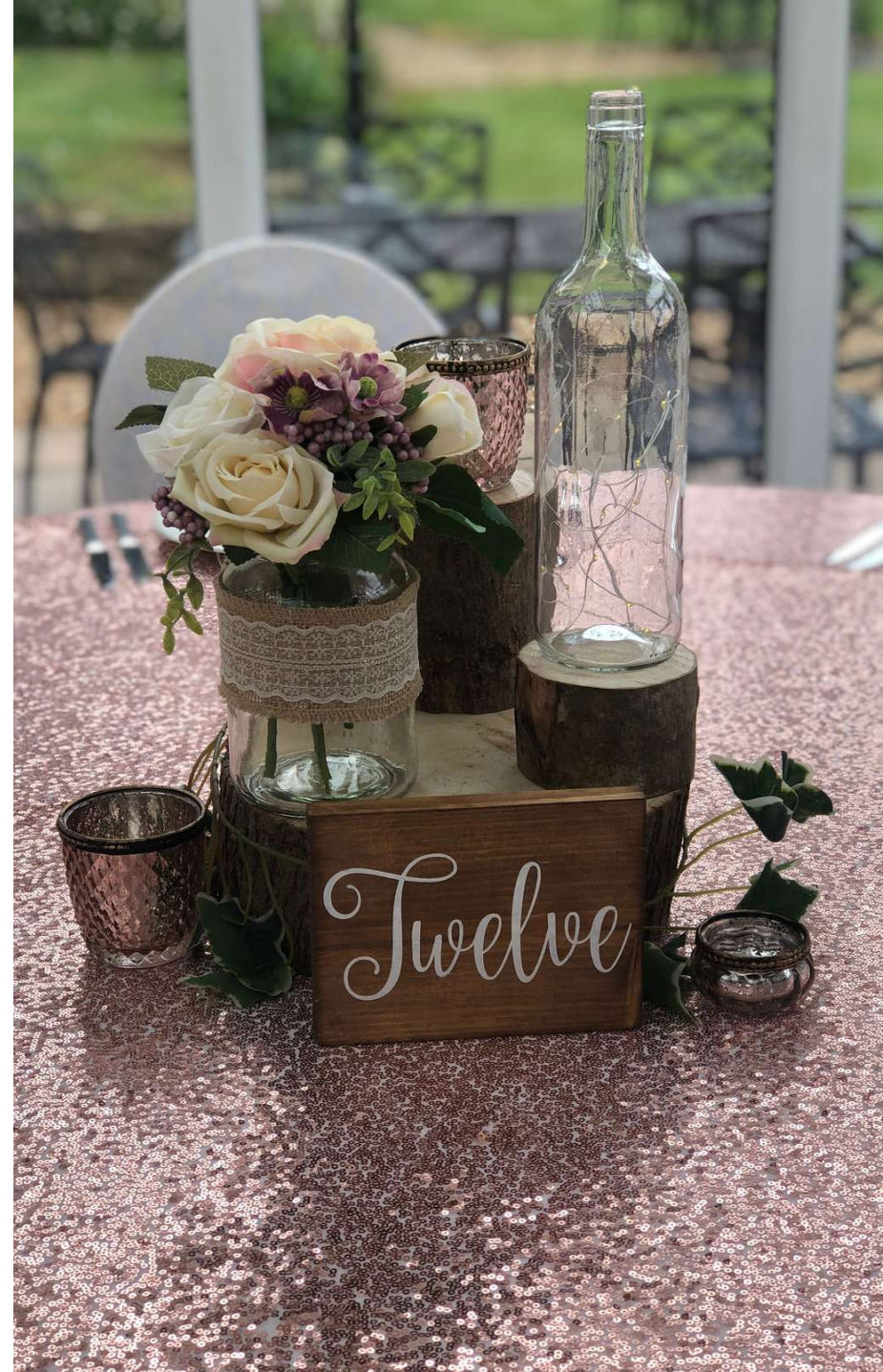
Sequin table cloths

Our sequin over lays are available in silver, rose gold, navy and white. If you need a different colour please let us know!