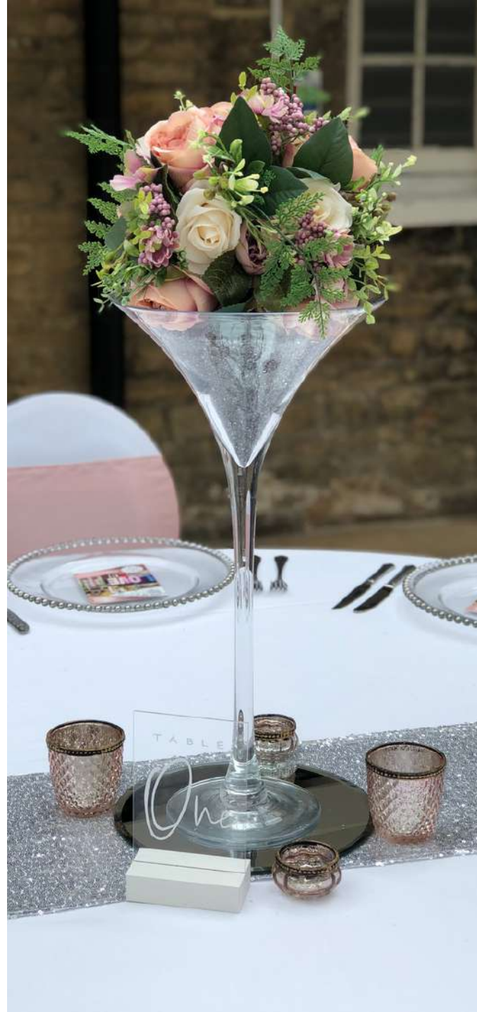
Martini Glass - Vintage arrangement