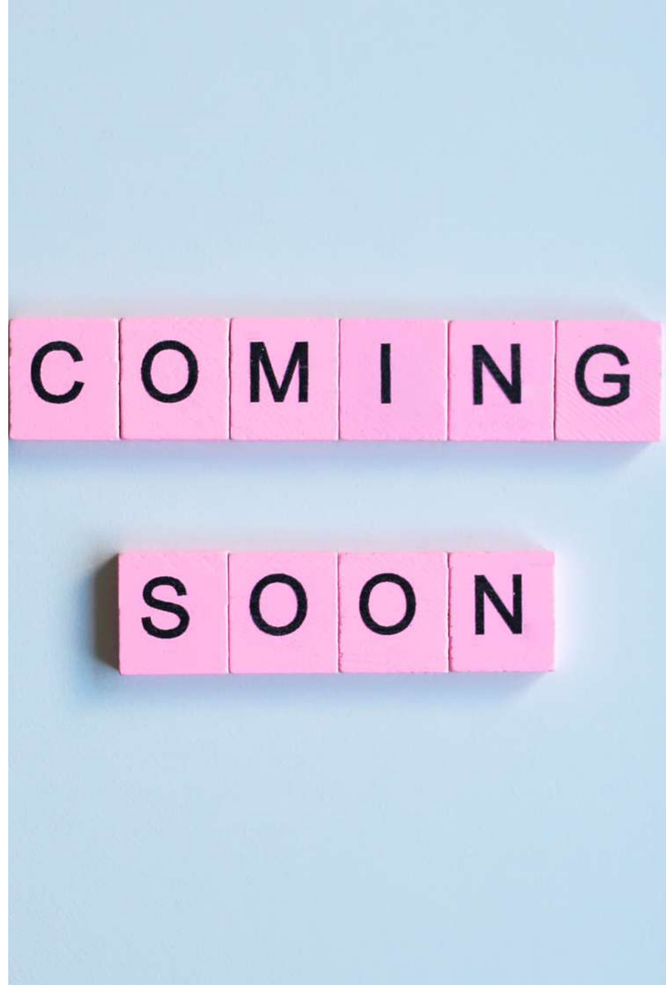
Rustic sweet stall