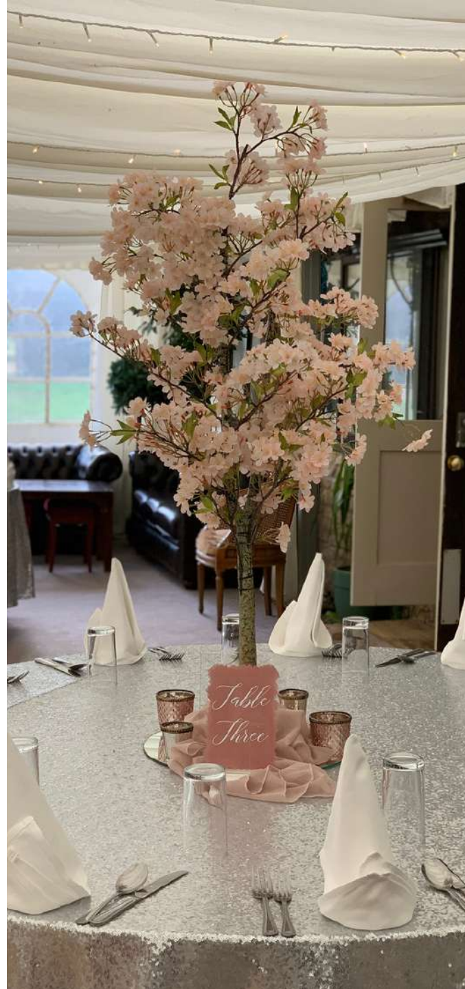
Pink Blossom Tree