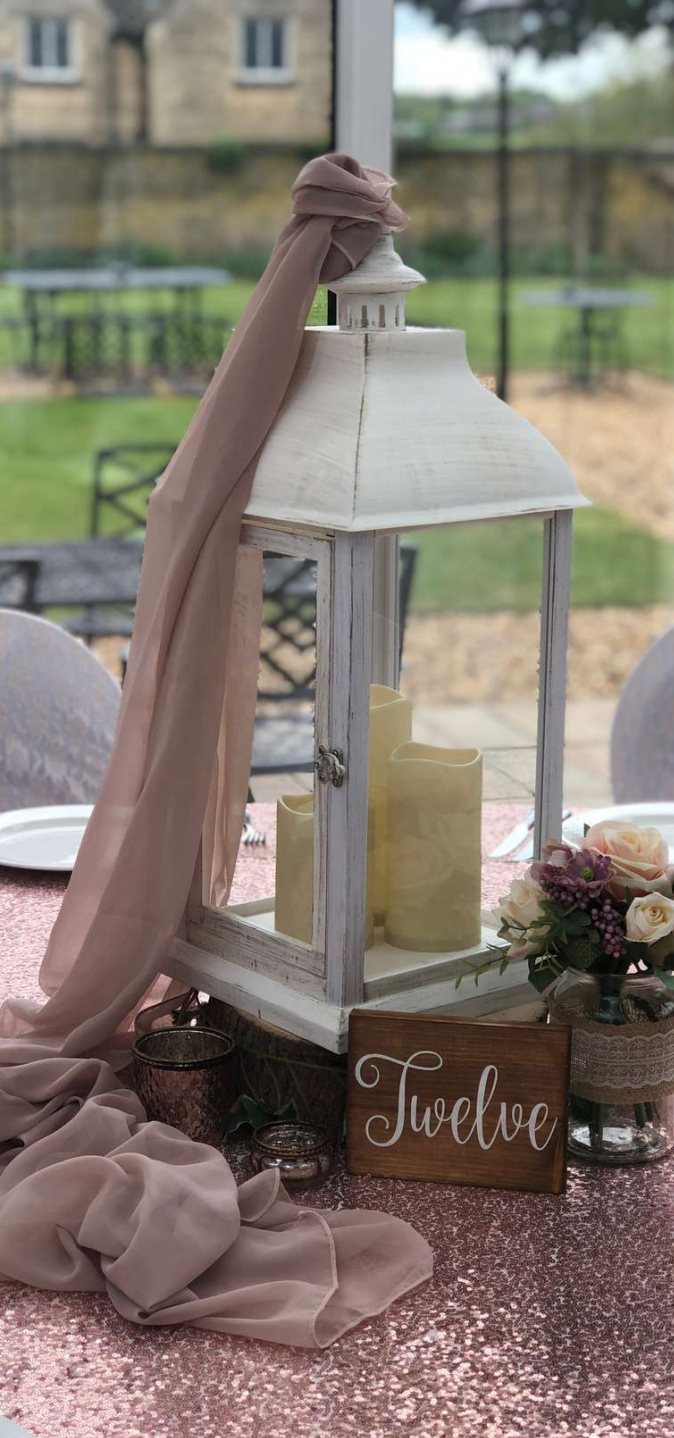
Lantern with logs, drape, flowers and candles