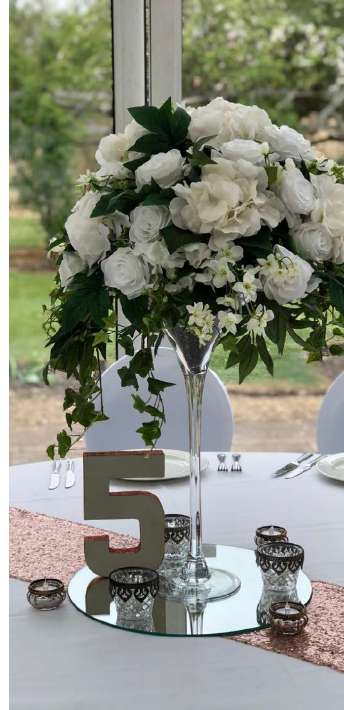
Martini Glass- White & Green arrangement